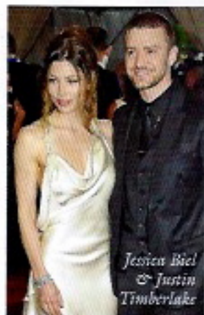
Jessica Biel & Justin Timberlake

You don't have to travel far to achieve the look and feel of a destination wedding. Incorporate romance into everything from décor, table settings, and even your invitation with a light color palette and floral accents.