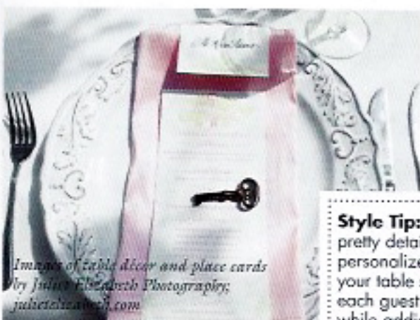
Images of table décor and place cards

Style Tip: Incorporate pretty details and small personalized touches into your table setting to make each guest feel special while adding an extra element of décor.