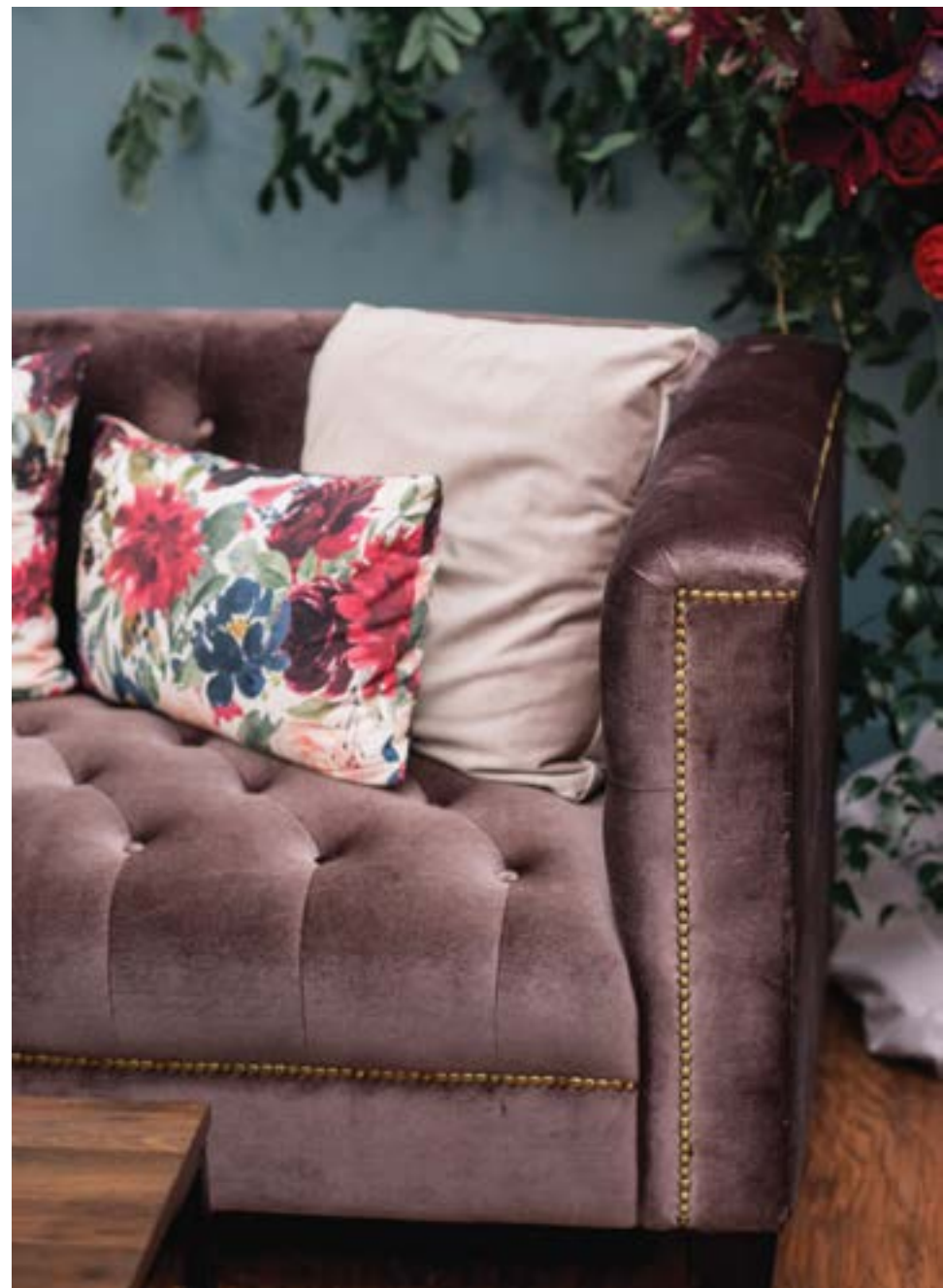
(this page and opposite) Clusters of rich-hued fruit—cherries, blueberries, blackberries, and pomegranates—offered organic opulence to reception tablescapes. “We told WED that we wanted romantic, Victorian vibes,” notes Maggi. Gilded candelabras, ornate glassware, crushed velvet sofas, overflowing florals, and an abundance of flickering candles delivered with aplomb. “I wanted to be able to enjoy the wedding with the most minimal amount of stress possible,” says Maggi. “Between moving states and adjusting to life with a newborn, I figured the best way to accomplish this would be to leave it to the professionals. It was absolutely surreal seeing the final design and how all of the details worked together to create the perfect space.”